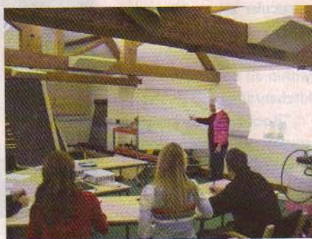
Classroom based learning is complemented by on hands training at ESE's Oxfordshire training facility.

complemented by extensive practice on roof rigs and the entire process is explained and tutored from beginning to end.